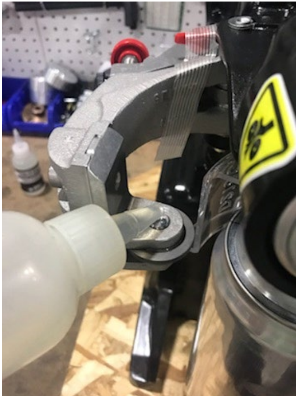
Seam Rollers (first and second)