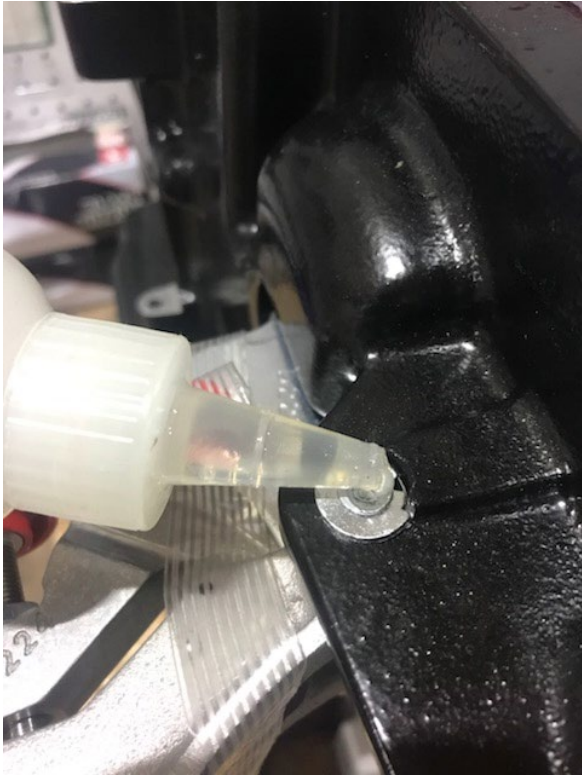
Seaming Lever Pins Left and Right