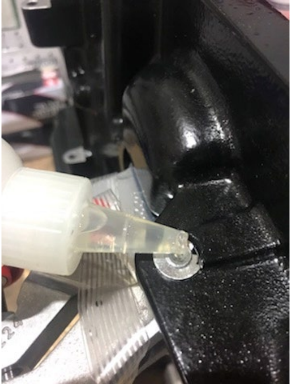
Seaming Lever Pins, Left and Right